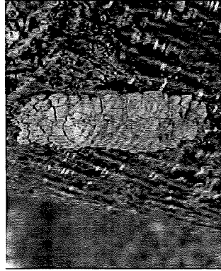
Egg Mass. Found September-June.

What you may be seeing during the month of June: